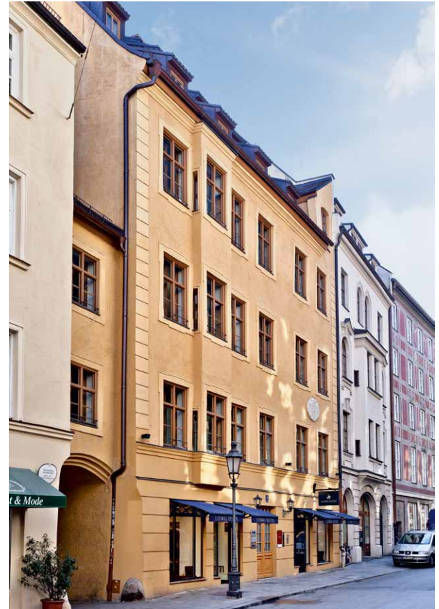
Munich, Cuvilliés-Haus, Burgstrasse 8

AS ARCHITECT AND ARTIST IN THE SERVICE OF THE BAVARIAN PRINCES PALATINE, HE BUILT AMONG OTHER THINGS THE AMALIENBURG IN THE NYMPHENBURG PALACE PARK.