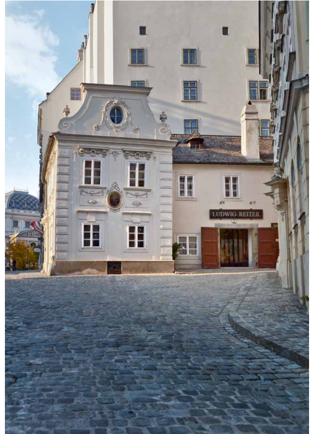
Vienna, Drei Mäderl Haus, Mölkersteig 1

WHETHER THE BUILDING CALLED DREI MÄDERL HAUS REALLY DERIVES ITS NAME FROM THE CHARMING DAUGHTER OF A VIENNESE BURGHES FAMIL ALLEGEDLY WORSHIPPED BY FRANZ SCHUBERT – OR EVEN A SALONNIÈRE OF DUBIOUS REPUTATION – REMAINS A HISTORICAL MYSTERY. WHAT IS CERTAIN: THE LISTED BIEDERMEIER BUILDING ERECTED IN 1803 AND LARGELY RETAINED IN ITS ORIGINAL FORM IS A RARE GEM OF CULTURAL HISTORY. THE DREI MÄDERL HAUS STANDS ON THE RUINS OF THE FORMER VIENNA CITY WALL, THE MÖLKER BASTEI – NAMED AFTER THE COURT BELONGING TO THE MELK MONASTERY THAT ONCE LAY BEYOND THE WALL.