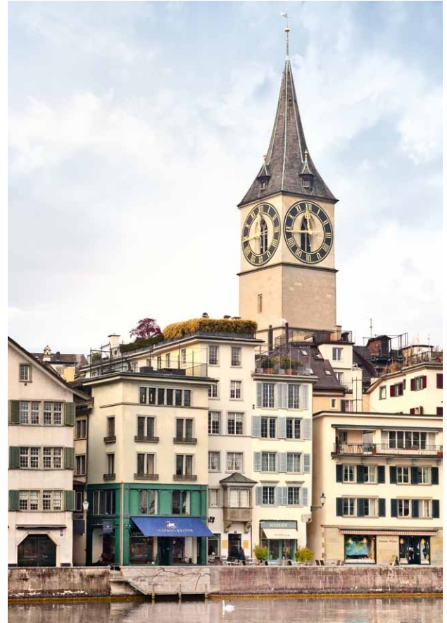
Zurich, Wühre 9

THE HOUSE WÜHRE 9, HALF WAY BETWEEN THE CITY HALL AND THE MÜNSTER BRIDGE, IS EMBEDDED IN A HISTORIC ENSEMBLE , MARKED BY THE FRAUMÜNSTER CHURCH, THE GUILDHALL “ZUR MEISEN” AND THE ST. PETER CHURCH. HERE IN THE 19 TH CENTURY ELEGANT SHOPS WERE ESTABLISHED IN THE MIDST OF THIS MEDIEVAL SETTING BY GOLDSMITHS, BOOKSELLERS, TAILORS, MILLINERS, AND – SHOEMAKERS.