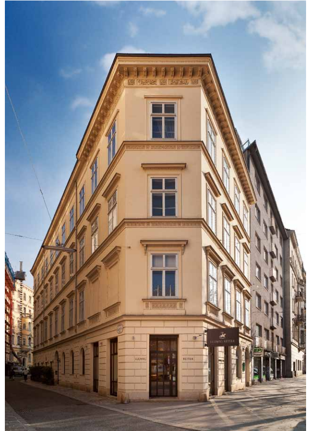
Vienna, Wiedner Hauptstrasse 41

THE WIEDNER HAUPTSTRASSE HAS ONLY BORNE ITS CURRENT NAME SINCE 1862 – RECALLING THE MEDIEVAL ENDOWMENT – “WIDEM” – A NEARBY HOSPITAL FOR THE POOR MAINTAINED BY THE ORDER OF THE HOLY SPIRIT.