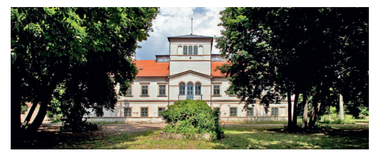
Süssenbrunn Manor in Vienna: where production of Ludwig Reiter shoes was relocated in 2011.

This is all expressed in Ludwig Reiter's leitmotif: "The future of tradition".