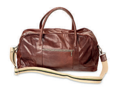
Rugby Bag, horse leather