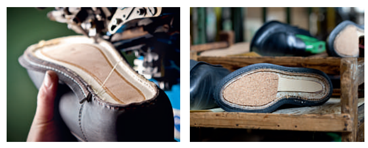
A genuine welted shoe is created through between 200 and 300 distinct steps.

Thus the upper part of the shoe and the outer sole are connected not directly but indirectly, and hence flexibly, with each other. This means the shoe can follow flexibly the foot's complex movement when walking. The cork filling, wooden shank and leather lining all help assure great comfort and ease in wearing.