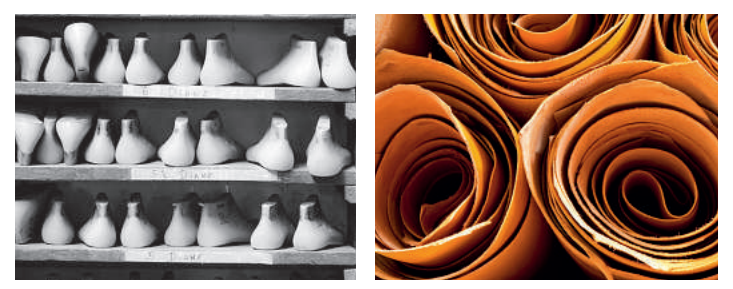
A "custom-made" shoe is produced according to customer specifications: i.e. a combination of model, last, leather, and sole as desired.

About 40 different models of welted shoes—on 9 lasts for women resp. 15 for men—can be offered as the basis for a "custom-made" order.